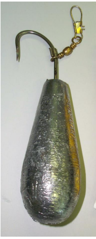
A down rigger ball with a snap-swivel (note the filed barb).