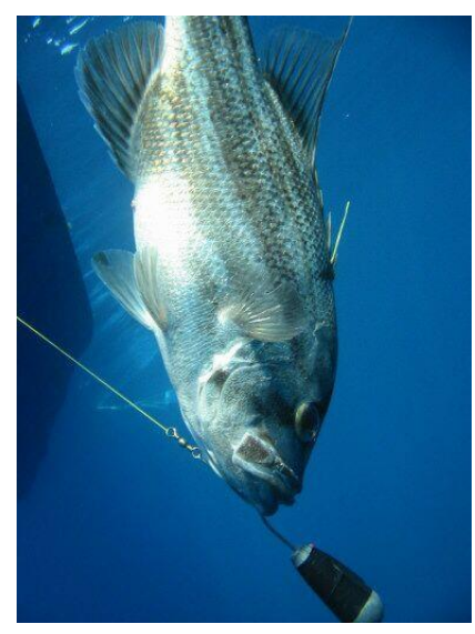
A West-Australian Dhufish being released using the down-rigger release weight system