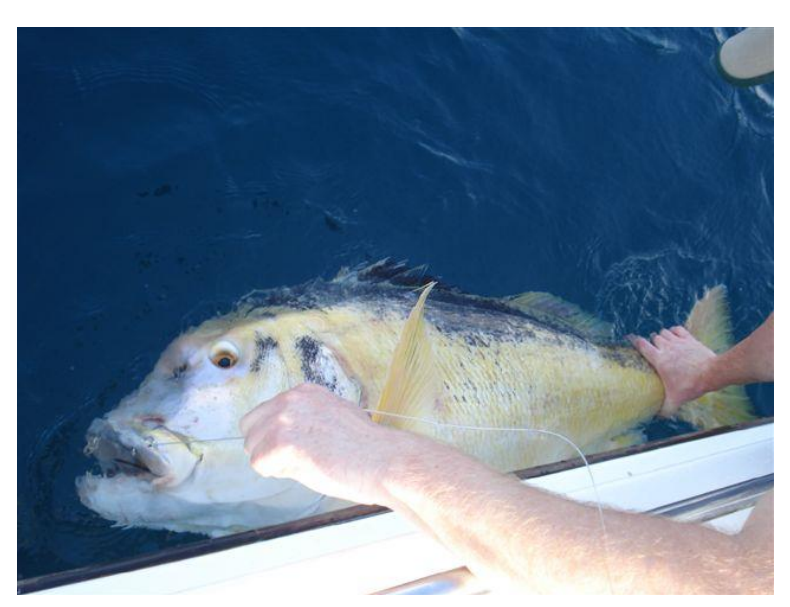
A tagged red steenbras about to be released using the down rigger system