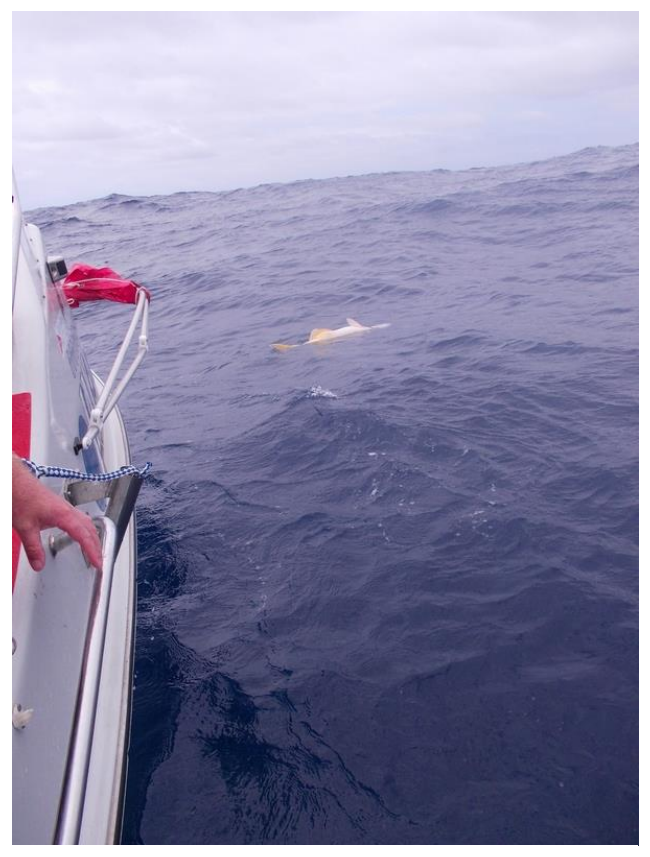
A released red steenbras suffering from barotrauma